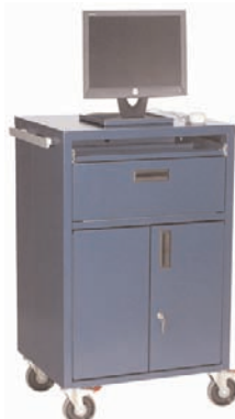
Mobile Technology Workstation