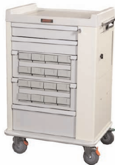
Long Term Care Cart