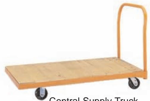
Central Supply Truck