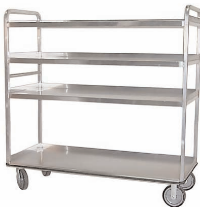
Queen Mary Cart