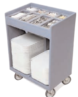
Silverware and Tray Cart