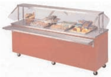
Mobile Salad Bar

Applications: Dish Carts, Mobile refreshment Stands, Hospital/Service Carts, Standard Service Carts, Food Prep Carts, Insulated Food/Beverage Service Carts, Silverware and Tray Carts, Equipment Stands, Utility Carts, Bussing/Transport Carts, Queen Mary Carts, Utility Trucks, Platform Trucks, Mobile Vending Carts, and Mobile Salad Bars.