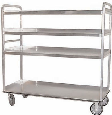
Queen Mary Cart