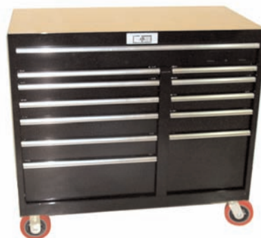
Mobile Tool Box