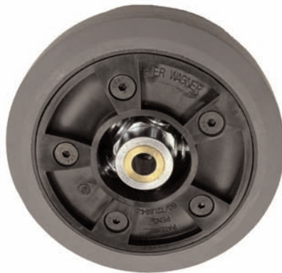
Thermoplastic Rubber Tread