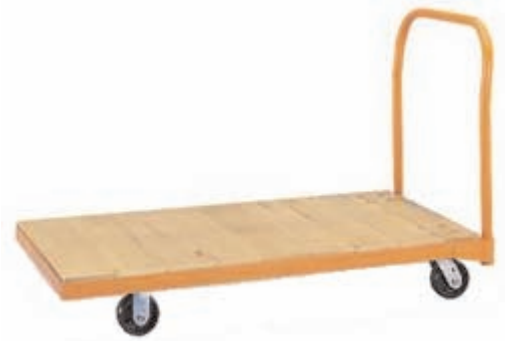
Central Supply Carts