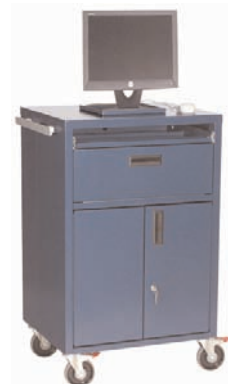
Mobile Technology Workstation